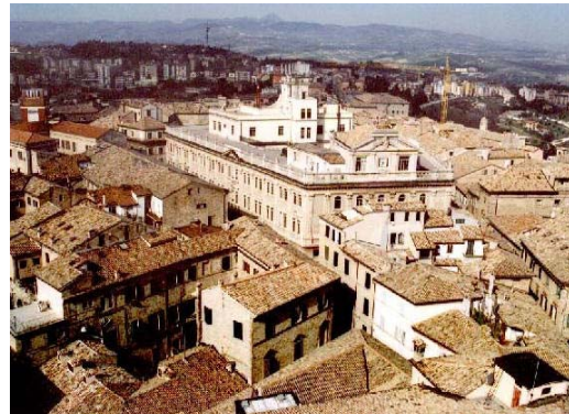
View of Macerata

The City of Macerata is central southern Italy a few kilometres inland from the Adriatic coast, in South Europe. Macerata is an ancient Roman city with a medieval city centre located on the top of a hill and other areas distributed on the plain. It has 41.000 residents c.a. and several manufacturing industries.